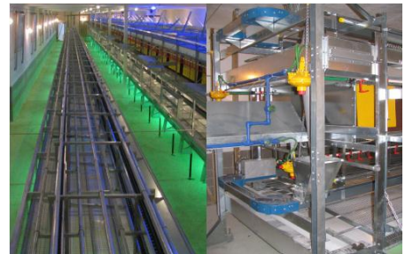
Stable construction Perches: profiled or round tube