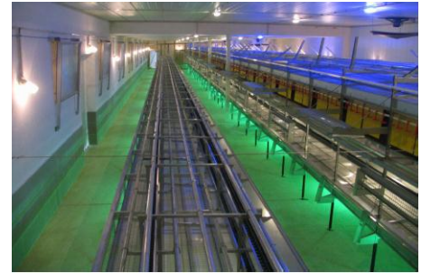
Easy access to nests, feed and water due to short, animal-friendly distances