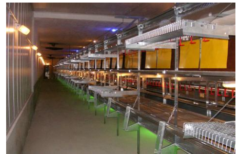
End-to-end, walk-in approach balconies in front of the nests facilitate easy removal of the birds from the upper tiers Safe collection of eggs laid on slats from the egg collecting channel. No egg pecking